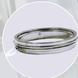
Ring For Zinser Worsted RIF