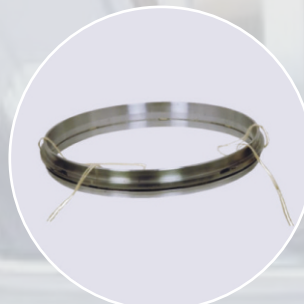
Ring For Heavy Doublers for Monofilament Yarn