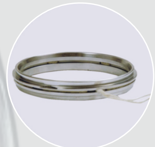
Ring For Heavy Doublers