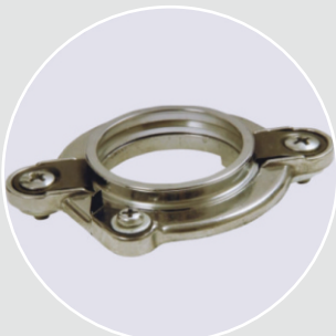
Ring For L.R RIF