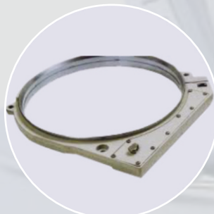
Ring For Saco - Lowel MIC