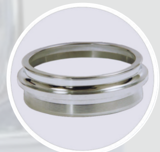
Ring For MEINMM Ring Frame