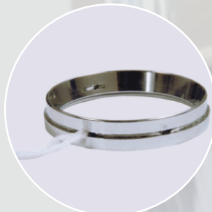
Ring For Textool RIF